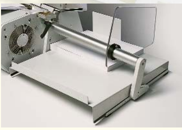
paper tray collects punched sheets

SEMI-AUTOMATIC PUNCHING The semi-automatic system developed by Renz, creates an entirely new class of machines. It is the first punching system to feature ease of operation, high output, and flexibility at an economical price.