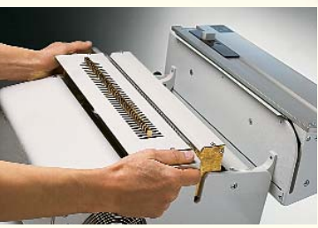
change die easily for different types of punching